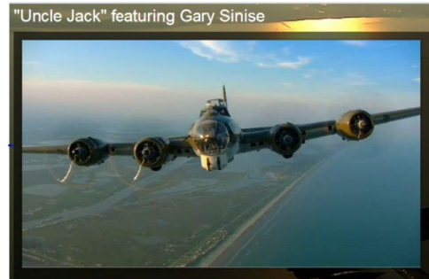
"Uncle Jack" featuring Gary Sinise and his uncle.

http://www.sleepingdogtv.com/reel/Uncle-Jack.aspx